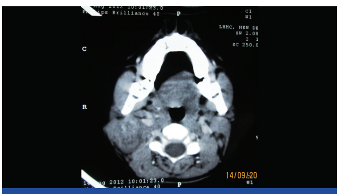
[Table/Fig-1]: Axial CT XI Nerve Schwannoma.

An 11-year-old boy presented with a mass on right side of neck for about 4 months, gradually increasing in size without any other associated symptom. On examination, it was 4x3cm in size, firm, non-tender, mobile from side to side, lying deep to upper 1/3rd of sternomastoid muscle. Oropharyngeal and indirect laryngoscopic examination did not show any abnormal finding. All cranial nerve and peripheral nerve examination was normal. CECT scan showed a biphasic enhancing mass of 4x3cm on the right side of neck deep to sternomastoid muscle and pushing internal jugular vein and common carotid artery anteromedially but did not suggest the nerve of origin [Table/Fig-1]. FNAC of the lesion did not reveal any definitive diagnosis. MRI of the lesion showed homogenous, isointense signal on T1 weighted images and on Gadoliniumenhanced T1 weighted images showed higher intensity [Table/ Fig-2]. Excision was planned under general anaesthesia. The patient was explained about the possible complications of surgery